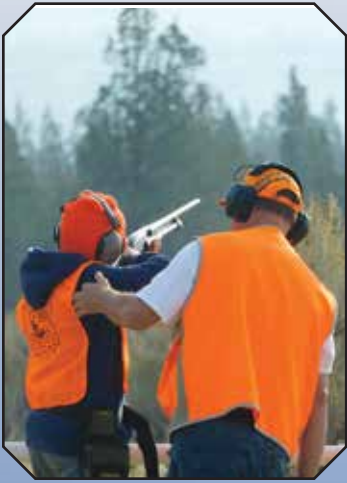
OHA members taught shot-gun skills at youth bird hunts.

Oregon youngsters got a chance to earn their wings last fall at youth upland bird hunts hosted by the Oregon Department of Fish and Wildlife and OHA at locations around the state. Wild birds live at many of the hunt areas, and more birds were released for the youth hunts.