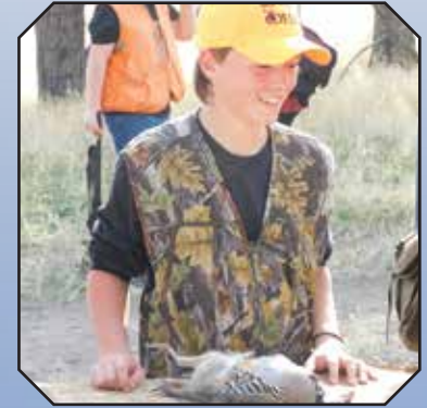
A young man gets ready to clean a chukar he bagged.

OHA and other sportsmen's groups cook breakfast and lunch for young hunters and their families, and some of these folks and their dogs go out in the field with kids to help them find birds. Besides the pheasants that are released, kids can take wild birds like doves and quail that are in season.