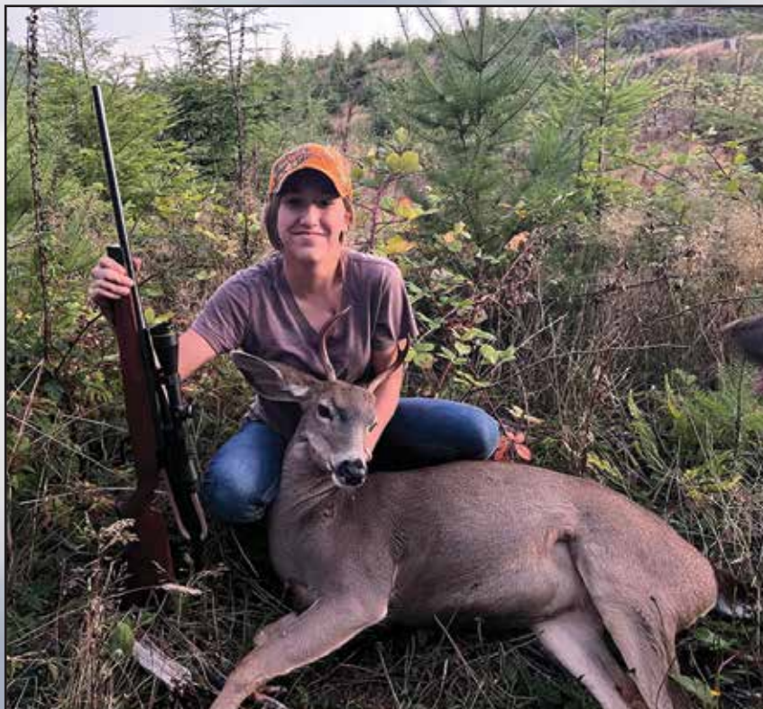
Oregon's youth hunts and the Mentored Youth Hunter Program offer kids great opportunities to hunt big game.

For more details about Oregon's First-Time Hunter program, which OHA helped create, and Oregon's Mentored Youth Hunter Program for kids ages 9 through 15, see the 2026 Oregon Big Game Regulations in outdoor stores or at MyODFW.com