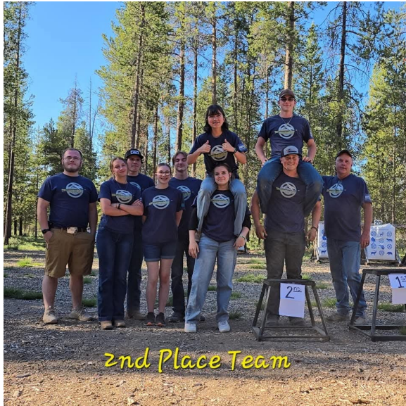
The LaPine Hawks took 2nd Place Team