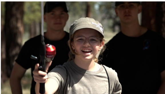
2 cadets helping at the Backyard Bass station, watch a participant trying to snatch a fish