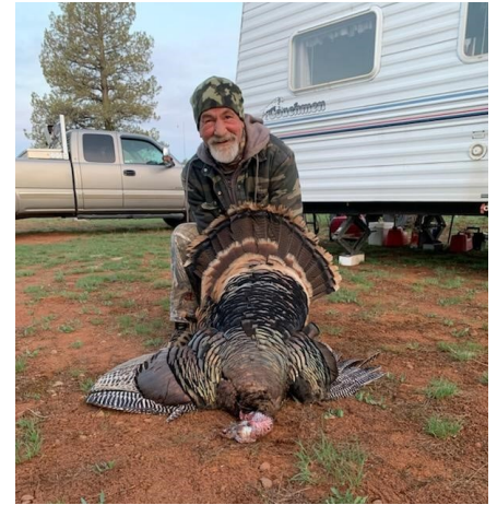
After the “long” trek back to camp

The OHA State Office asked chapters to share this with their membership: