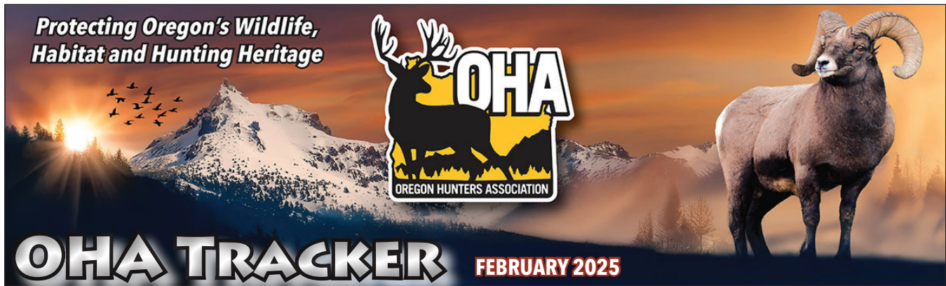
This new 20-foot banner featuring a life-size bighorn ram will serve as a backdrop for OHA booths at sports shows this winter. Stop by and enter our cool raffles!