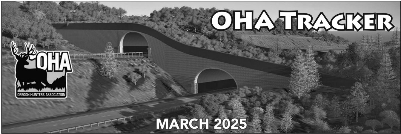
An artist's rendering shows the future wildlife crossing over Interstate 5 south of Ashland, which will be Oregon's first wildlife overpass. A similar new overpass in Idaho is already showing impressive results.