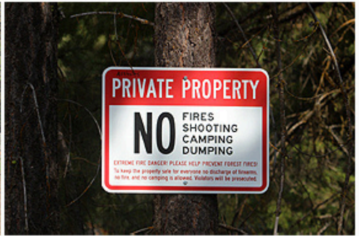
Private property sign, but the land is now public.