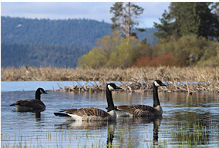
Canada Geese photo from the area.