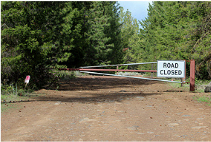
Gate blocking the road to the south end of Eagle Ridge.