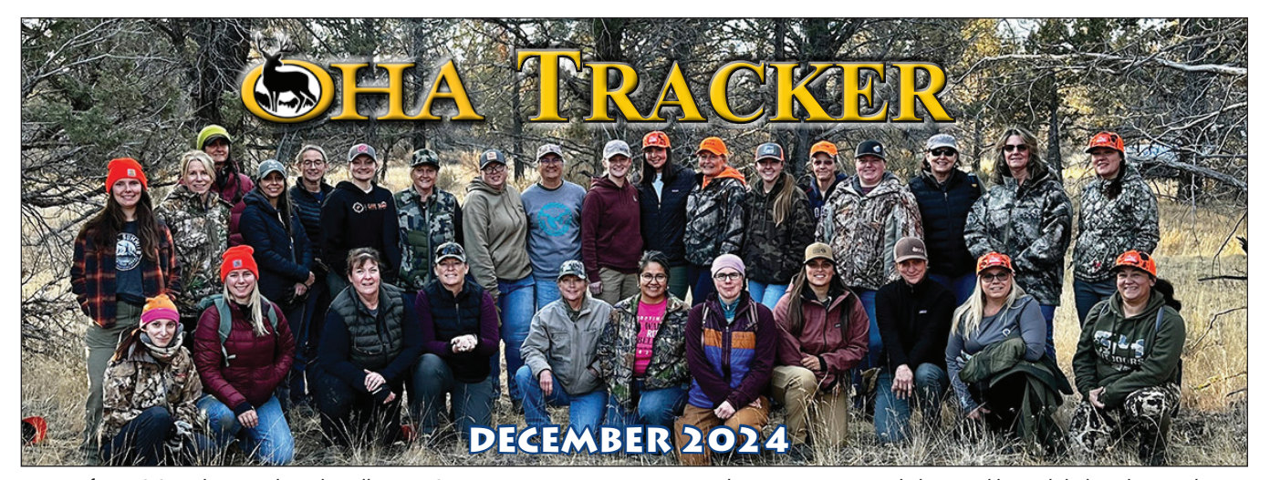
Women from 13 OHA chapters planted seedlings on OHA's conservation easement in Metolius Unit winter range habitat, and hunted chukars the next day.