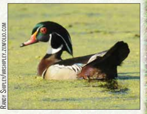
Wood ducks are one of our most common ducks now thanks to the efforts of groups like OHA.

OHA builds duck nesting boxes and places them next to lakes, ponds and streams. Every winter, volunteers gather to build and put up boxes so they are up and ready for ducks to nest in during the spring.