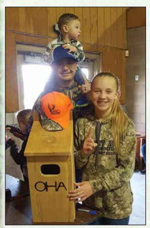
OHA chapters build nesting boxes for ducks that nest in trees, such as wood ducks and mergansers.

Wood ducks need trees to nest in. The Oregon Hunters Association is making sure ducks get what they need to build nests and hatch their eggs.