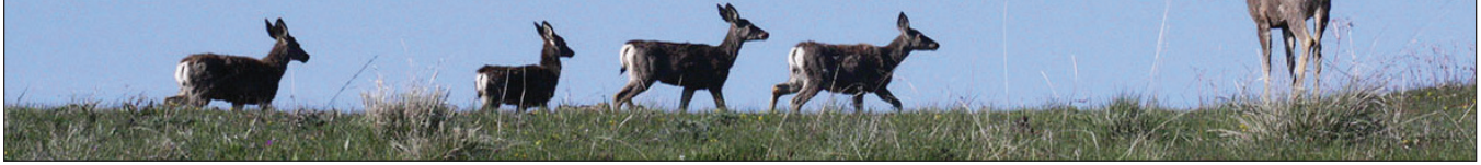
BLUE MOUNTAIN MULEYS/DUANE DUNGANNON