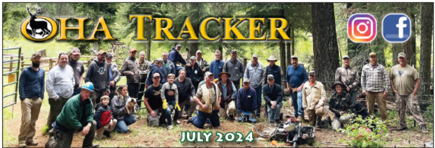
Many hands made light work at OHA's Southwest Cascades Meadow Protection Regional Project in the Rogue Unit on June 15 and 16.