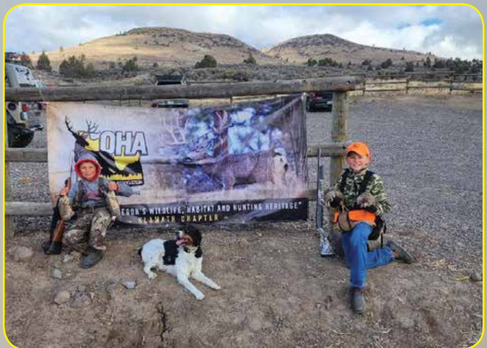
These happy hunters bagged chukars at a hunt hosted by OHA's Klamath Chapter.

At some of the hunts, OHA and other sportsmen's groups cook breakfast and lunch for young hunters and their families, and some of the volunteers go out in the field with kids to help them find birds. Many of the hunts also offer clay target shooting, and OHA members volunteer to help with that, as well.