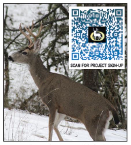
Join OHA for a weekend regional blacktail habitat project at White River Wildlife Area June 10-11.

SB 348: Seeks to institute all of Measure 114 plus an additional 3-day waiting period, raises the age to 21 for PTP, continues the standard capacity magazine ban, makes sheriffs the permitting agents, increased the fees almost threefold from $65 to $150, and increases processing time from 30 to 60 days. Contains a provision stating any legal challenge, including the constitutionality, must be filed in the Circuit Court in Marion County. This bill is currently in the Ways & Means Committee.