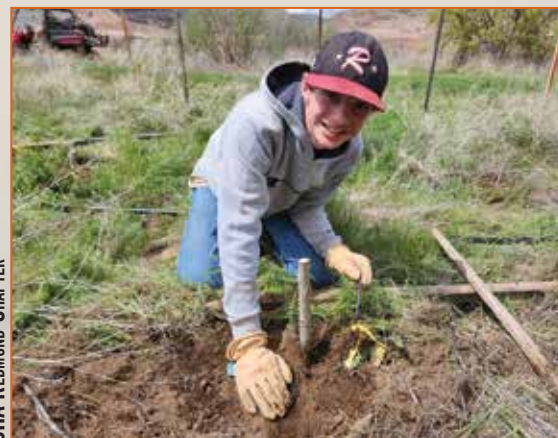
Young volunteers helped out at many OHA projects this spring.

Most of these events didn't exist before OHA formed 40 years ago, so kids today should feel lucky to get to do these things, and get out there and have fun!