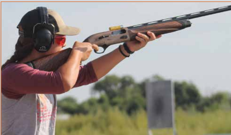
OHA members help kids sharpen shooting skills at youth events around the state.