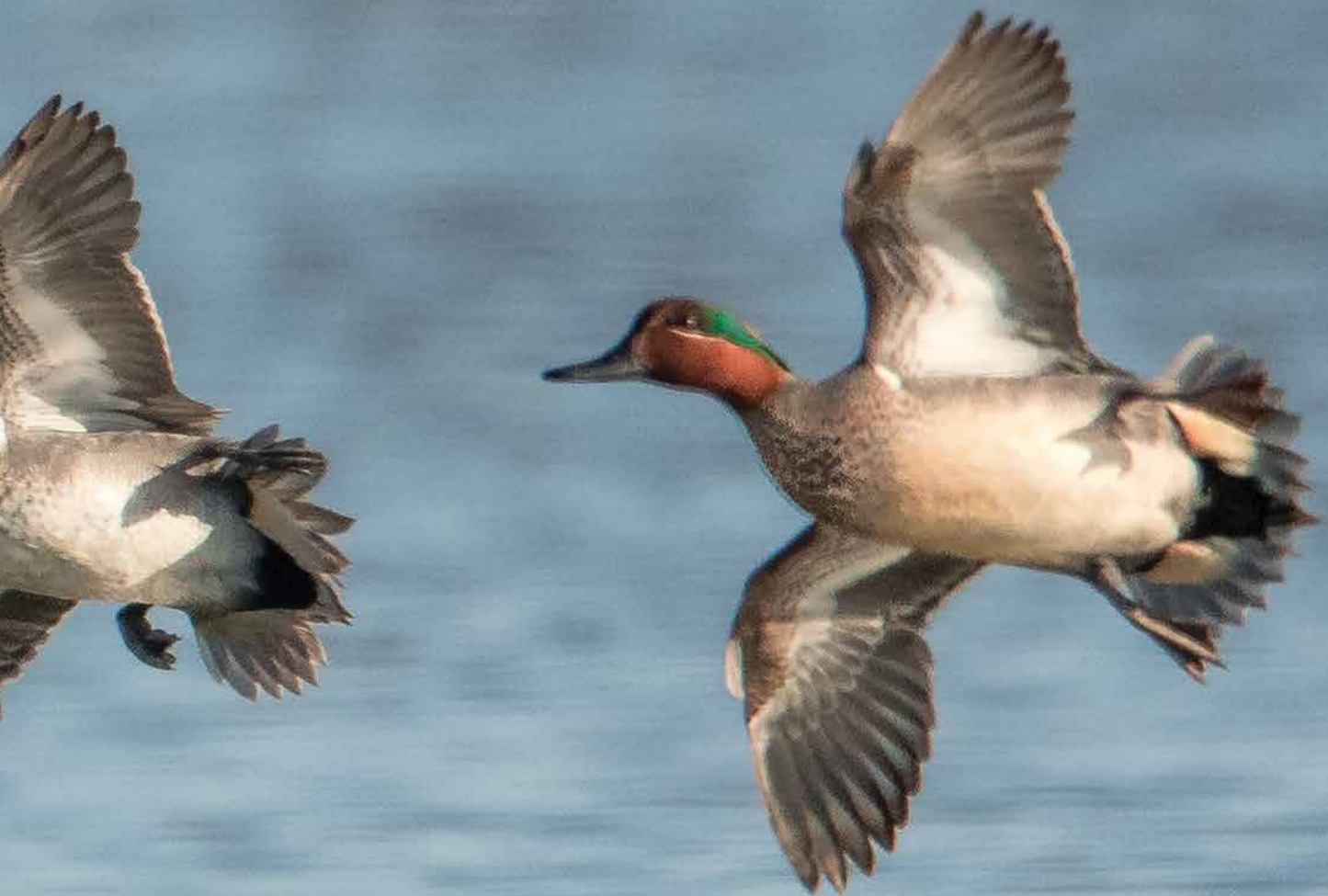
Rogue Valley Green-Wing Teal

Most ducks taken in Oregon are puddle ducks.