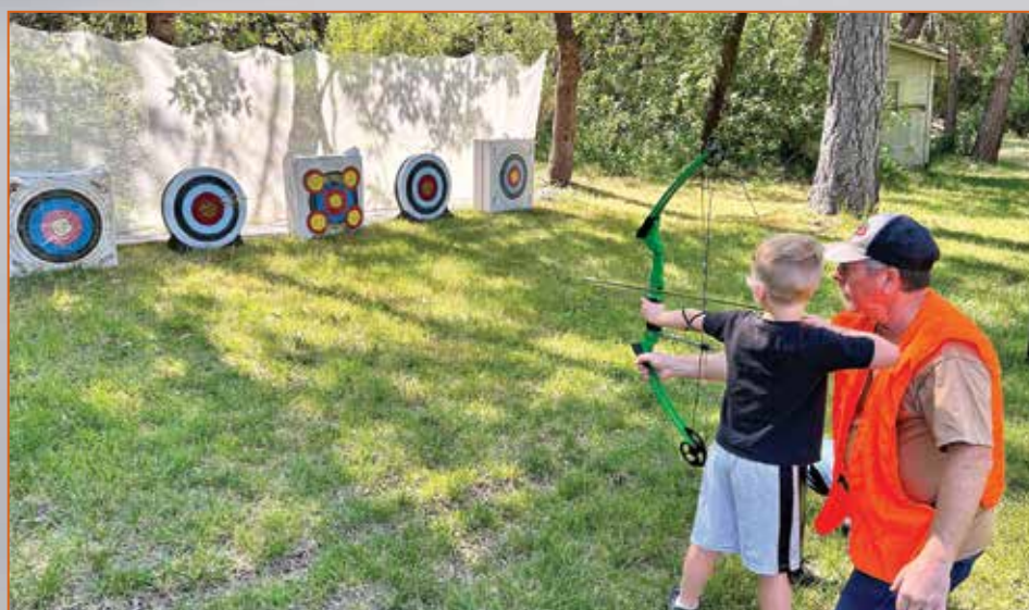
Kids got to try their hands at archery at OHA's youth events this spring.