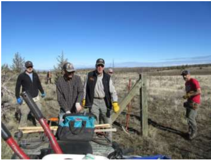
USFS and OHA preparing to roll out the next section of wire with a quad.