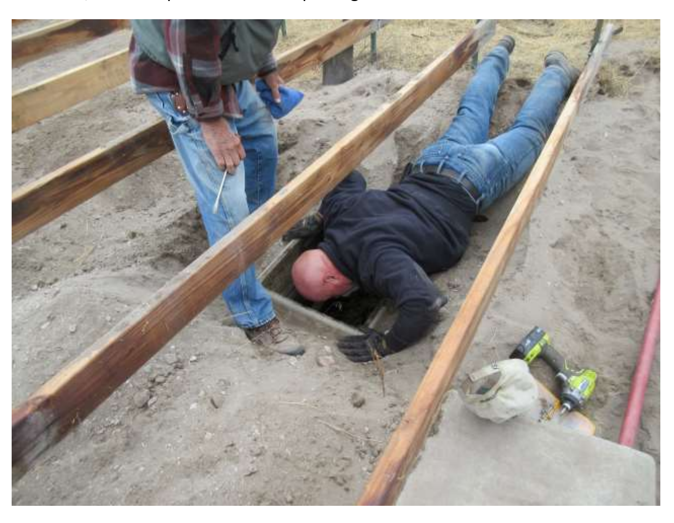
Lots of movement and activity happening below.