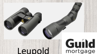
Leupold Combo Binocs & Spotting Scope $1,100 Value