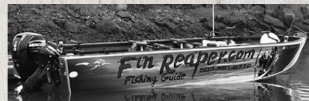
Four Seats Fishing With Fin Reaper $1,000 value