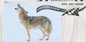
Predator package $1,250 value