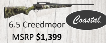
6.5 Creedmoor MSRP $1,399