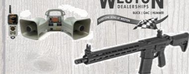
Predator package $1,250 value $1899.00