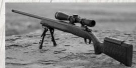
Pacific Lamp Wholesale 300 Win Mag $3,000 value