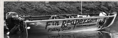
Four Seats Fishing With Fin Reaper $1,000 value