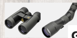
Leupold Combo Binocs & Spotting Scope $1,100 Value