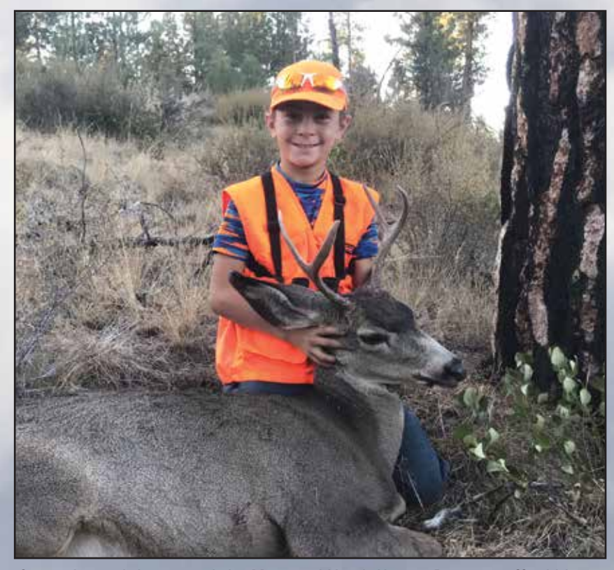
Oregon's youth hunts and the Mentored Youth Hunter Program offer kids great opportunities to hunt big game.

For more details about Oregon's First-Time Hunter program, which OHA helped create, and Oregon's Mentored Youth Hunter Program for kids ages 9 through 15, see the 2022 Oregon Big Game Regulations in outdoor stores or at MyODFW.com