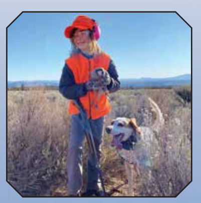
OHA members and their dogs helped out at youth hunts.

OHA and other sportsmen's groups cook breakfast and lunch for young hunters and their families, and some of these folks and their dogs go out in the field with kids to help them find birds. Besides the pheasants that are released, kids can take wild birds like doves and quail that are in season.