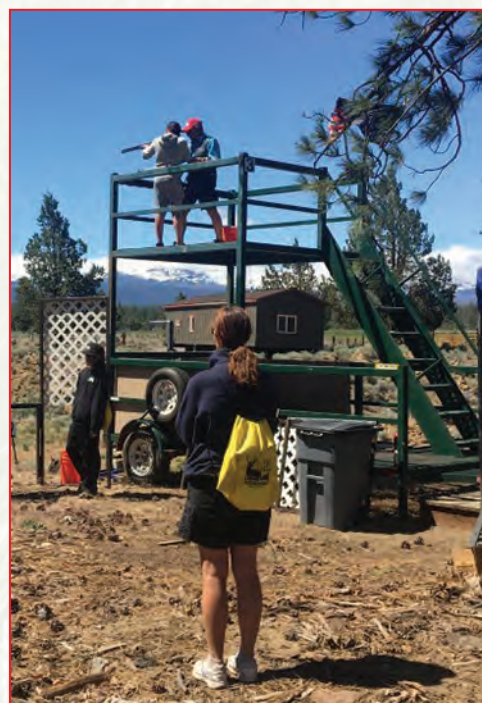
Sporting clays were a hit at this summer's OHA Bend Chapter youth day.

You can stay up to date on youth events in your area by logging on to www.oregonhunters.org