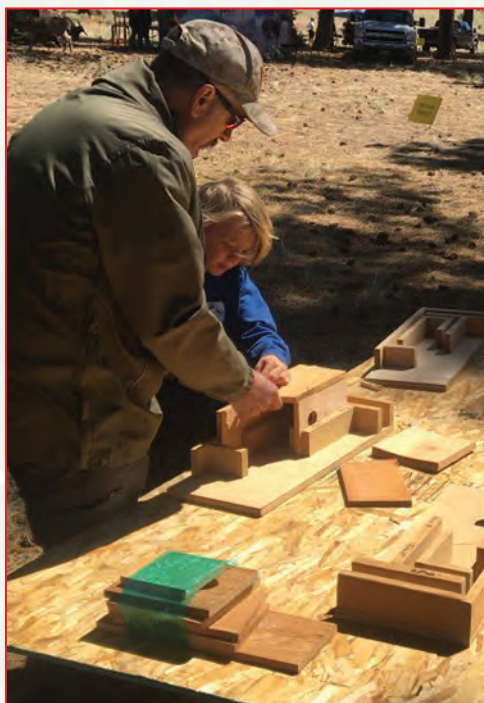
Kids built bird houses at the OHA Bend Chapter youth day this summer.

T he Oregon Hunters Association holds special youth field days for kids. Some are free, while others charge a small amount to cover the costs of putting on the events.