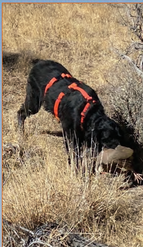
Last year's OHA youth chukar hunt was a blast for kids who participated.