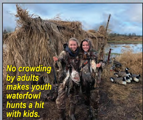
No crowding by adults makes youth waterfowl hunts a hit with kids.

The number of participants for this youth hunt will be limited.