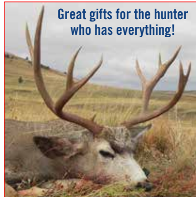
PHOTOS FROM TNC'S ZUMWALT PRAIRIE PRESERVE

Win a 2021 Dream Hunt for ELK or DEER on TNC's ZUMWALT PRAIRIE!