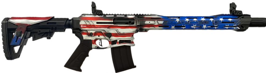
A Citadel BOSS-25 12 Gauge Tactical Style Shotgun w/ Cerakote USA Flag