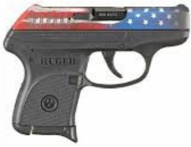
A Pair of Ruger LCP 380's with the American Flag on the slide

It's our American Flag Raffle and should you win, you will be able to choose one of the prizes below;