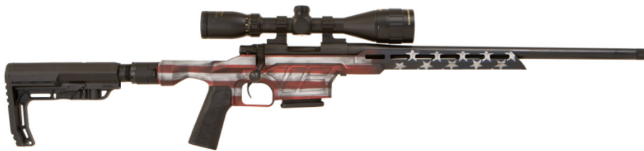
A Howa Mini Action EXCL Lite Series 223 REM w/ Nikko Sterling Gamepro 3.5x10 Scope