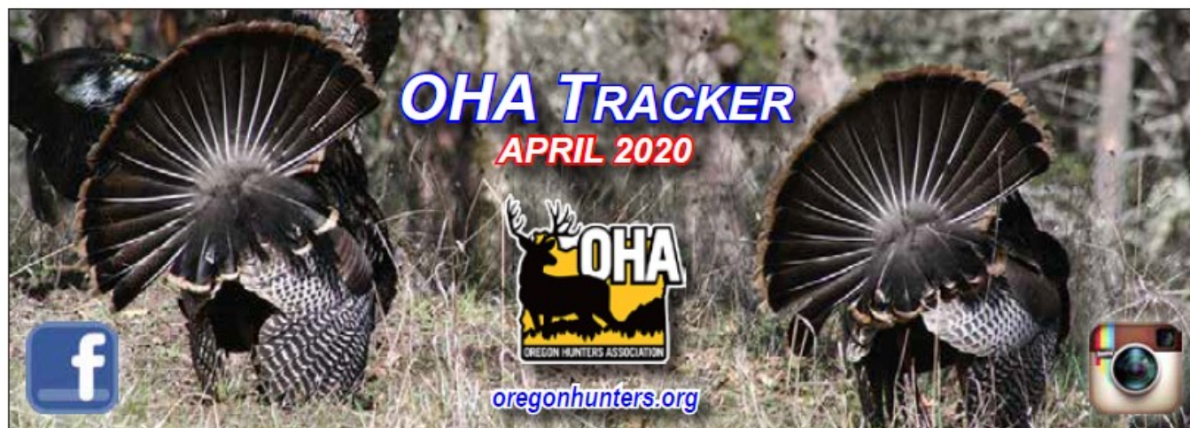
SOCIAL DISTANCING BY ROGUE VALLEY TURKEYS/DURNE DUNSMITH