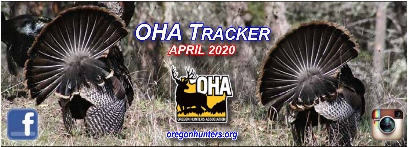
SOCIAL DISTANCING BY ROGUE VALLEY TURKEYS/DUANE DUNGANNON