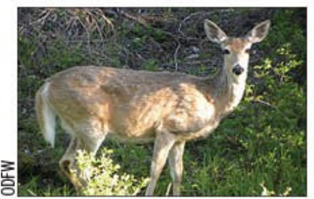
Some 2,000 whitetails have died in NE Oregon.

ODFW said it is still determining if deer tags for the fall 2020 seasons need to be reduced or hunts canceled in the units affected (Walla Walla, Mt. Emily, Ukiah). Hunters will be informed of any changes