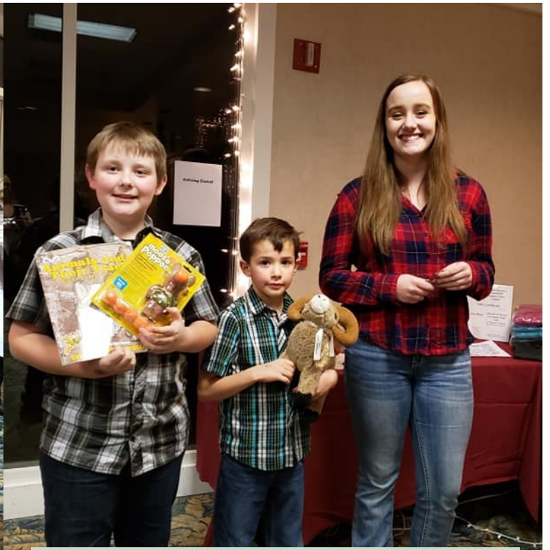
Coloring Contest Winners