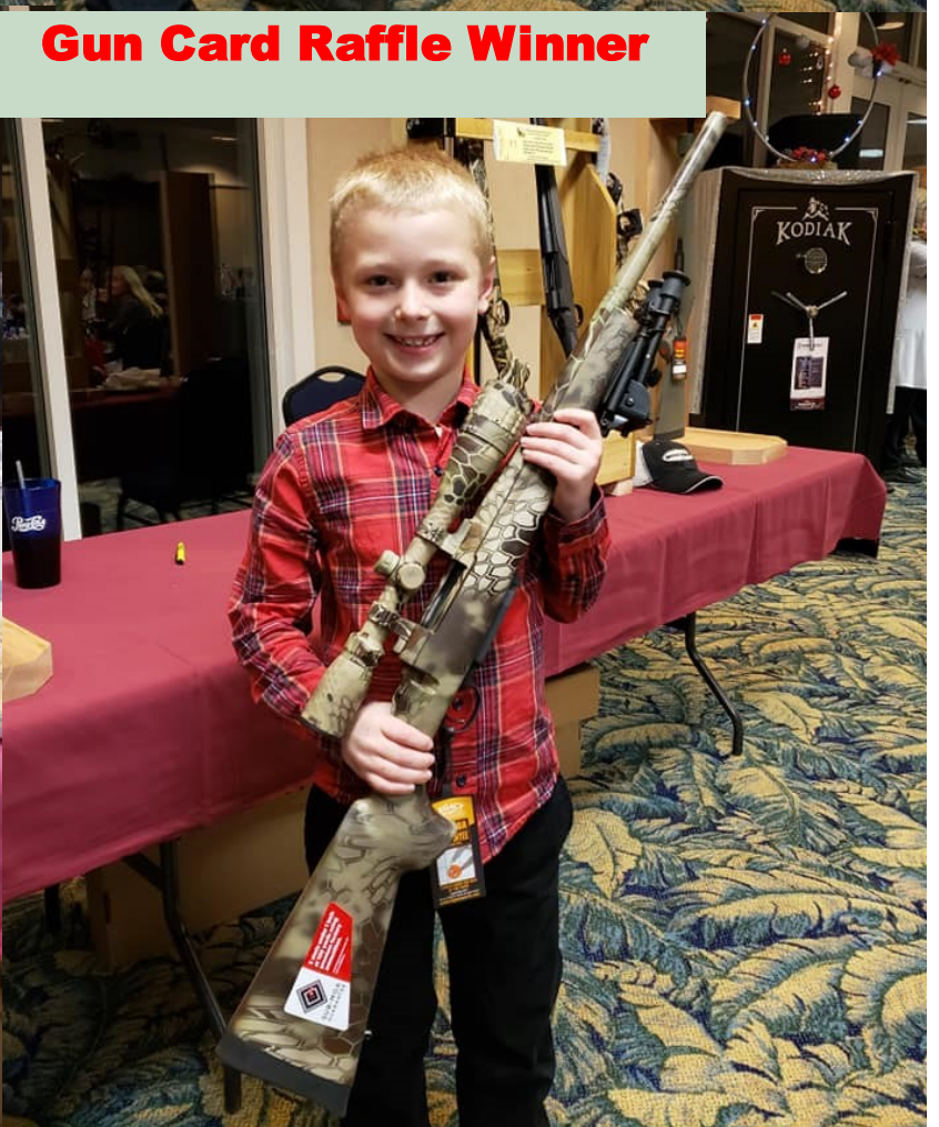
Gun Card Raffle Winner