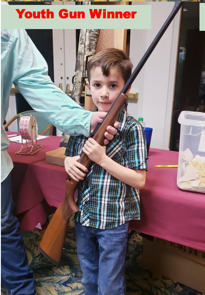
Youth Gun Winner