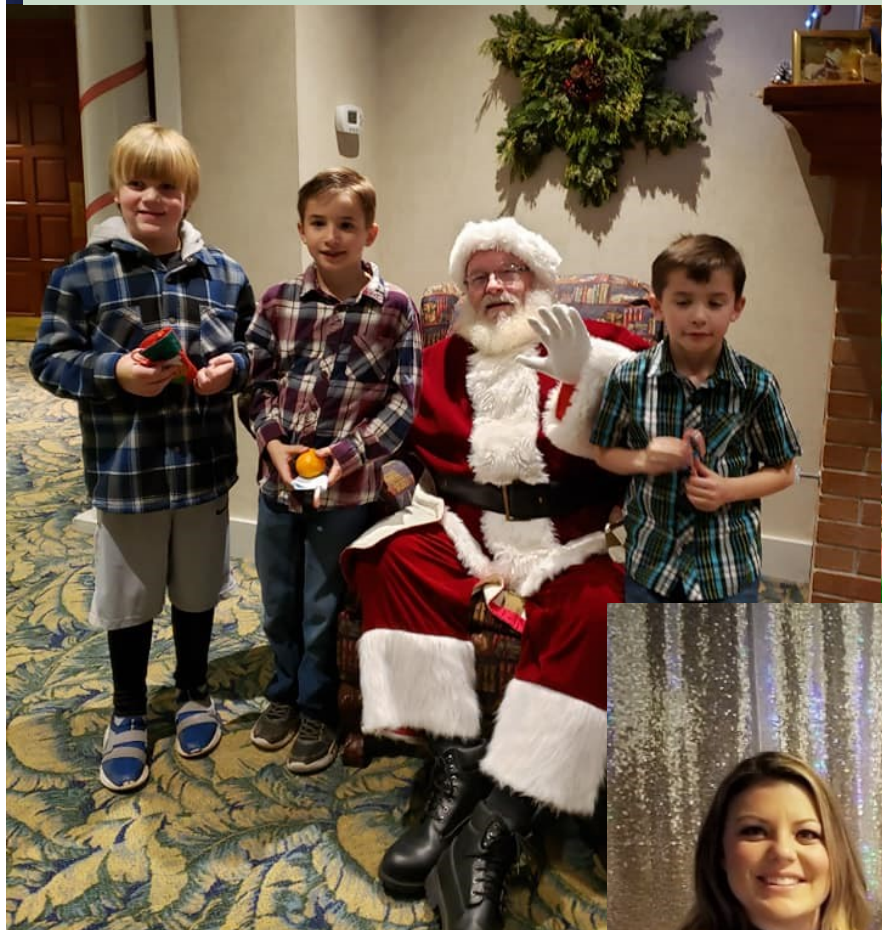
Some of our youth with Santa