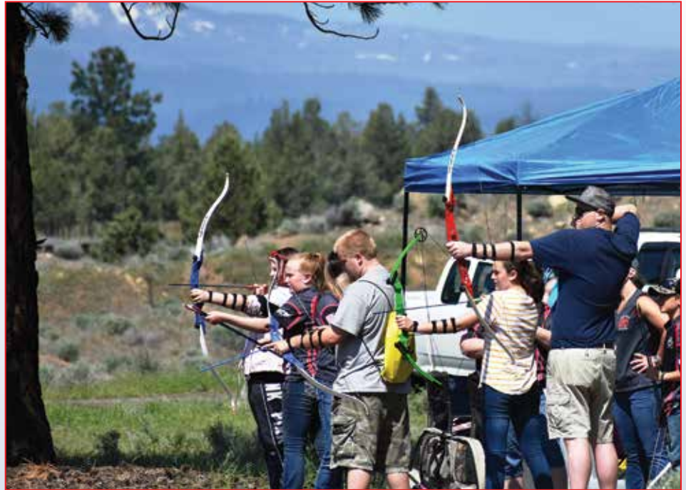
Young people got to try different outdoor skills at OHA youth events like this one in central Oregon.

You can stay up to date on youth events in your area by logging on to www.oregonhunters.org