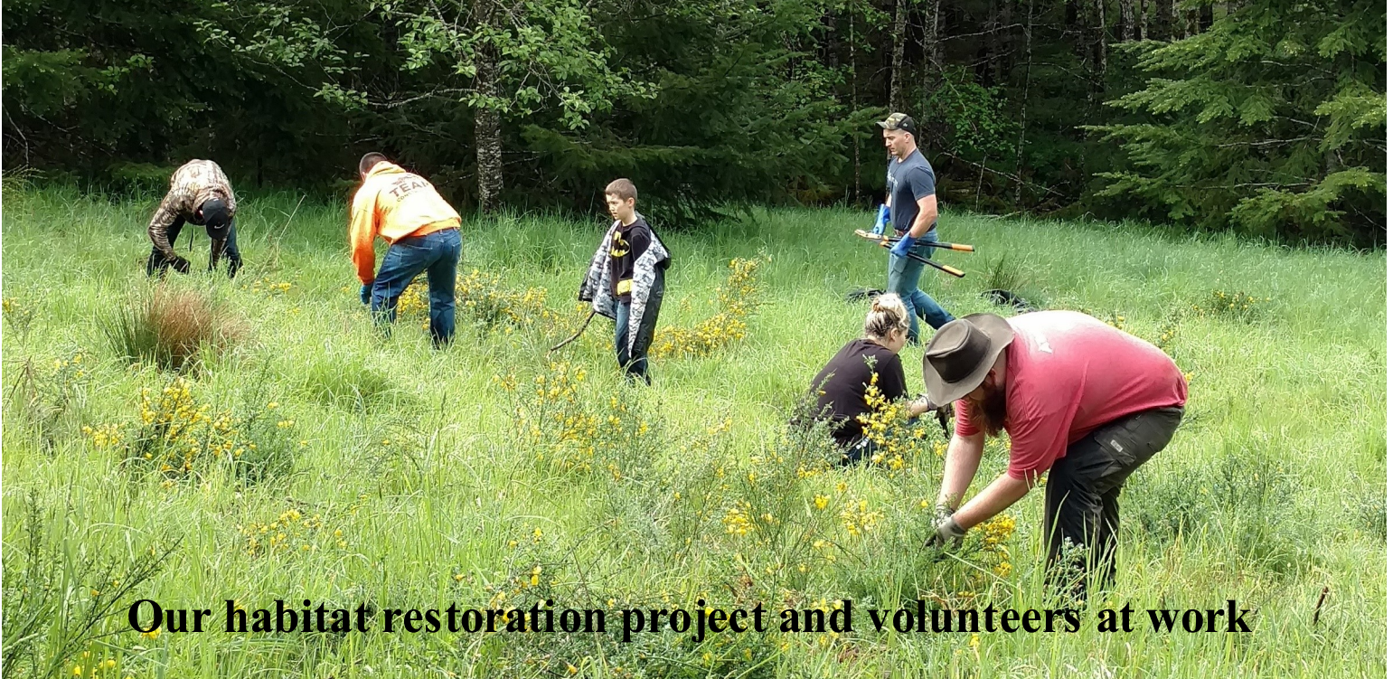
Our habitat restoration project and volunteers at work