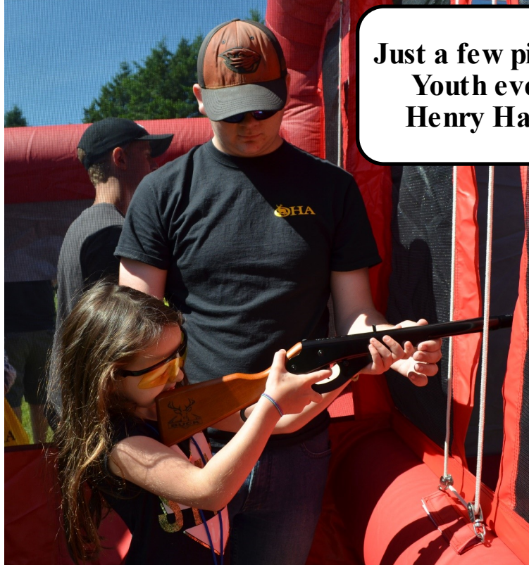
Just a few pics from our Youth event out at Henry Hagg Lake .