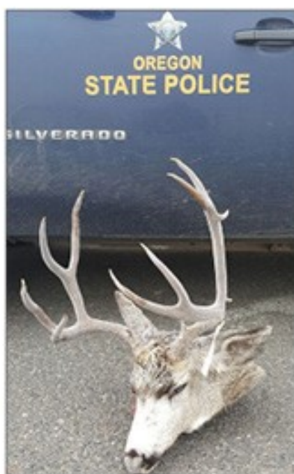
A poaching penalties bill supported by OHA and an anti-poaching program OHA got included in the ODFW budget are on their way to the Governor.

Update: The bill passed out of the House Committee on Natural Resources and