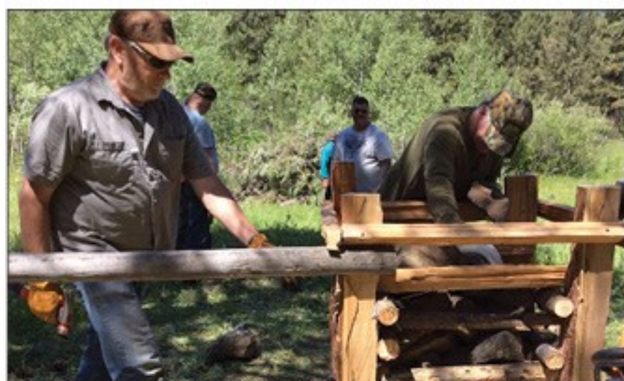
Volunteers cut encroaching conifers and built wildlife-friendly fencing to protect aspen stands.

To provide written testimony, send your comments or recommendations to: odfw.commission@state.or.us