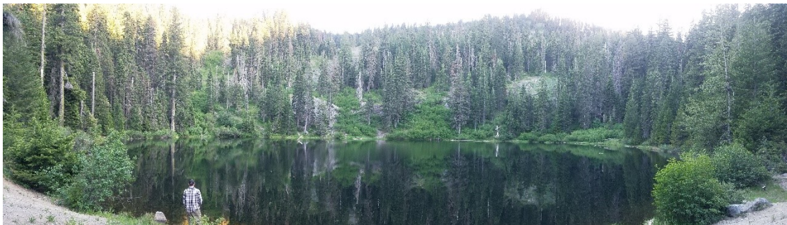
Figure 2: Miller Lake with fisherman