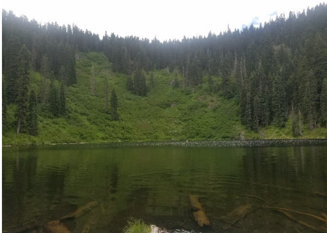
Figure 1: Tannen (Tanner) Lake