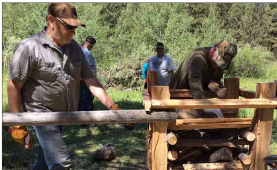
Volunteers cut encroaching conifers and built wildlife-friendly fencing to protect aspen stands.

To provide written testimony, send your comments or recommendations to: odfw.commission@state.or.us