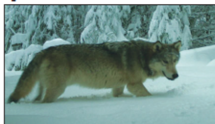
This wolf, caught on camera this winter, is a member of a new pack in the Indigo Unit.