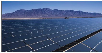
Quickly spreading, massive solar farms threaten Oregon's wildlife winter range.

Electronic Licensing: The new system has been functional since Dec. 1. The biggest confusion so far has centered around realizing that you need to register online before you can purchase your license and tags. To determine how to accomplish this via MyODFW.com, see page 4 in the 2019 Oregon Big Game Regulations. Find a useful article about the new system in the January/February OREGON HUNTER.