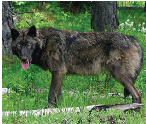
Wolf activists want no hunting in the Wolf Plan.

OHA has been a staunch advocate of keeping language in the revised wolf management plan that would provide for controlled hunting and trapping when thresholds outlined in the plan are reached. In recent meetings, wolf advocates have made it clear they will not support hunting and trapping ever being wolf management tools in Oregon.