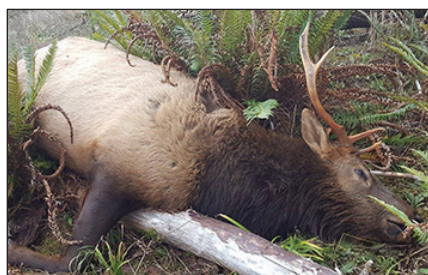
This elk was wasted Nov. 17 in the Trask Unit.

OHA is offering a $500 reward, or the informant may choose 4 preference points instead.