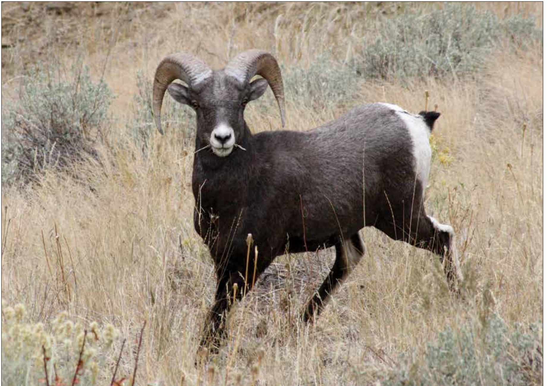
Lookout Mountain bighorn