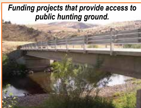
Funding projects that provide access to public hunting ground.