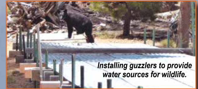
Installing guzzlers to provide water sources for wildlife.