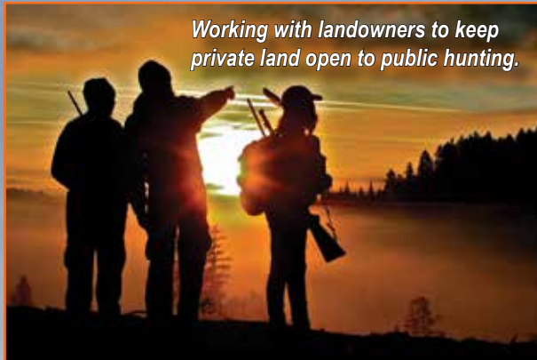
Working with landowners to keep private land open to public hunting.

Money we raise here is money that stays here. With over 10,000 members and 27 chapters in Oregon, OHA is helping wildlife and hunters wherever you live and hunt. Here are just a few recent examples: