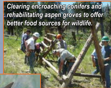
Clearing encroaching conifers and rehabilitating aspen groves to offer better food sources for wildlife.