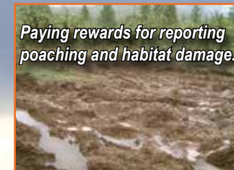
Paying rewards for reporting poaching and habitat damage.