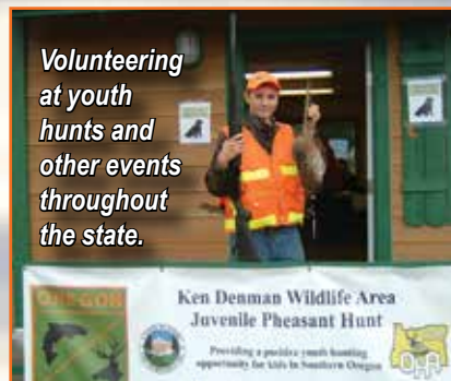
Volunteering at youth hunts and other events throughout the state.