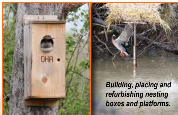
Building, placing and refurbishing nesting boxes and platforms.