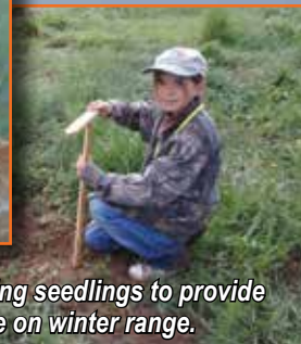
Planting seedlings to provide forage on winter range.