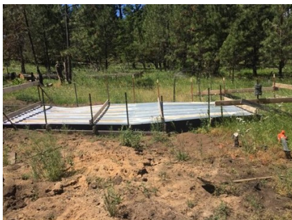
Left 2017 photo of Dry Corner. Right is June 2018 photo after apron was reinforced.

Overall the Guzzlers were in good shape this year with most of them being full however G10 (Dry Corner) was in need of repairs. On Saturday while the main project was taking place 3 Bend and 1 Tualatin OHA member returned to G10 repairing the fence and adjusting the apron which had sagged in places. Supports were placed in 3 locations under the apron and braces put in place. Next year the down spout from the gutter needs to be modified. Also the mesh screen will be modified so that easy access to the downspout exists which will aid in cleaning out the spout.