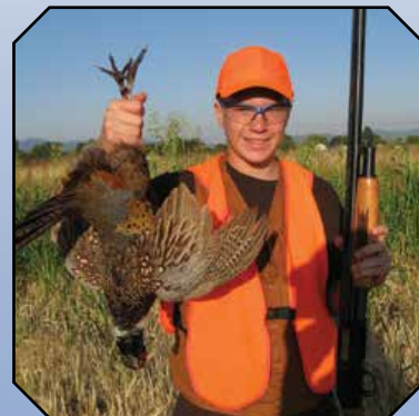
Some kids were fortunate enough to take birds home.

OHA and other sportsmen's groups cook breakfast and lunch for young hunters and their families, and some of these folks and their dogs go out in the field with kids to help them find birds. Besides the pheasants that are released, kids can take wild birds like doves and quail that are in season.