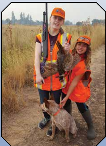
OHA members and their dogs helped out at youth hunts.