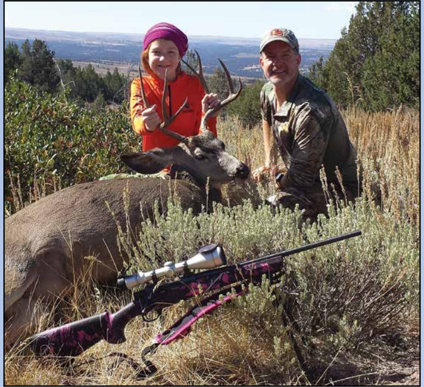
Oregon's youth hunts and the Mentored Youth Hunter Program offer kids great opportunities to hunt big game.

Oregon's "first-time hunter" program allows a hunter under age 18 who is unsuccessful in the controlled hunt drawing for deer or elk tags to reapply for a controlled hunt having a minimum number of tags and be guaranteed a first-time tag. For more details about Oregon's "First-time hunter program," see the 2018 Oregon Big Game Regulations. For more information about Oregon's Mentored Youth Hunter Program for kids ages 9 through 15, visit the ODFW web site at www.dfw.state.or.us