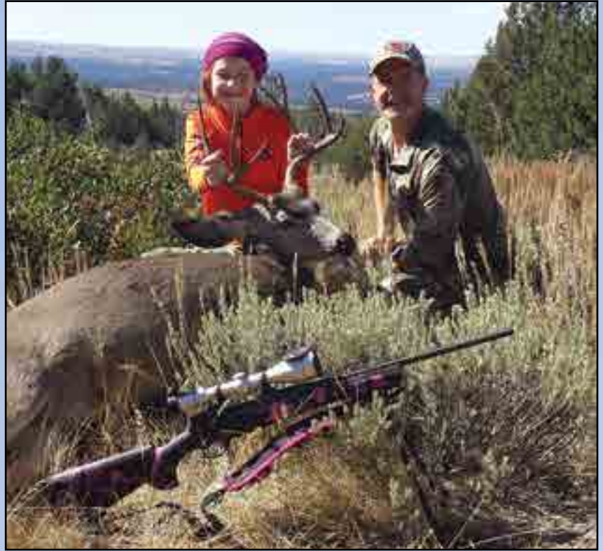
Oregon's youth hunts and the Mentored Youth Hunter Program offer kids great opportunities to hunt big game.

Oregon's "first-time hunter" program allows a hunter under age 18 who is unsuccessful in the controlled hunt drawing for deer or elk tags to reapply for a controlled hunt having a minimum number of tags and be guaranteed a first-time tag. For more details about Oregon's "First-time hunter program," see the 2018 Oregon Big Game Regulations. For more information about Oregon's Mentored Youth Hunter Program for kids ages 9 through 15, visit the ODFW web site at www.dfw.state.or.us