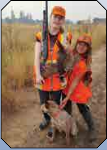
OHA members and their dogs helped out at youth hunts.

Oregon youngsters got a chance to earn their wings in September at special youth upland bird hunts hosted by the Oregon Department of Fish and Wildlife at locations around the state. Wild birds live at many of the hunt areas, and more birds were released for the youth hunts.