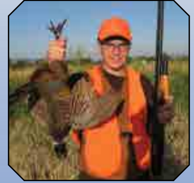
Some kids were fortunate enough to take birds home.

OHA and other sportsmen's groups cook breakfast and lunch for young hunters and their families, and some of these folks and their dogs go out in the field with kids to help them find birds. Besides the pheasants that are released, kids can take wild birds like doves and quail that are in season.