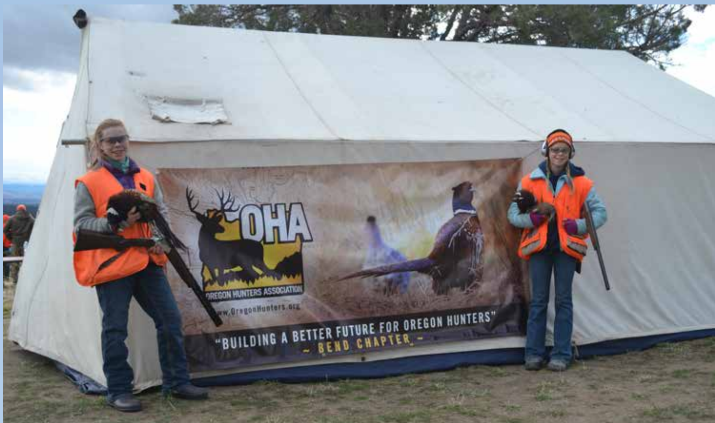
These girls took pheasants at the youth pheasant hunt hosted by OHA's Bend Chapter in November.

allows a hunter under age 18 who is unsuccessful in the controlled hunt drawing for deer or elk tags to reapply for a controlled hunt having a minimum number of tags and be guaranteed a first-time tag. For more details about Oregon's "First-time hunter program," see the 2017 Oregon Big Game Regulations. For more information about Oregon's Mentored Youth Hunter Program for kids ages 9-13, visit the ODFW web site at www.dfw.state.or.us