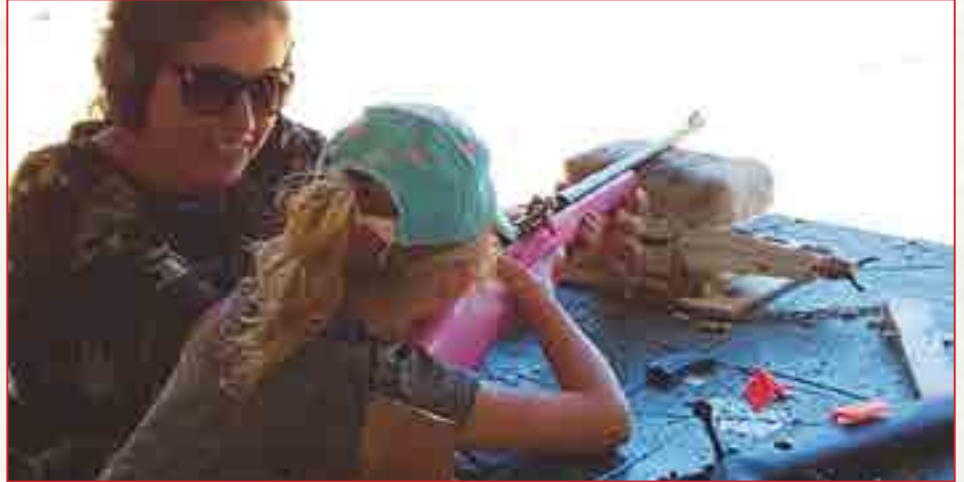
OHA's youth events help kids sharpen their shooting skills.

T he Oregon Hunters Association holds special youth field days for kids. Some are free, while others charge a small amount to cover the costs of putting on the events.