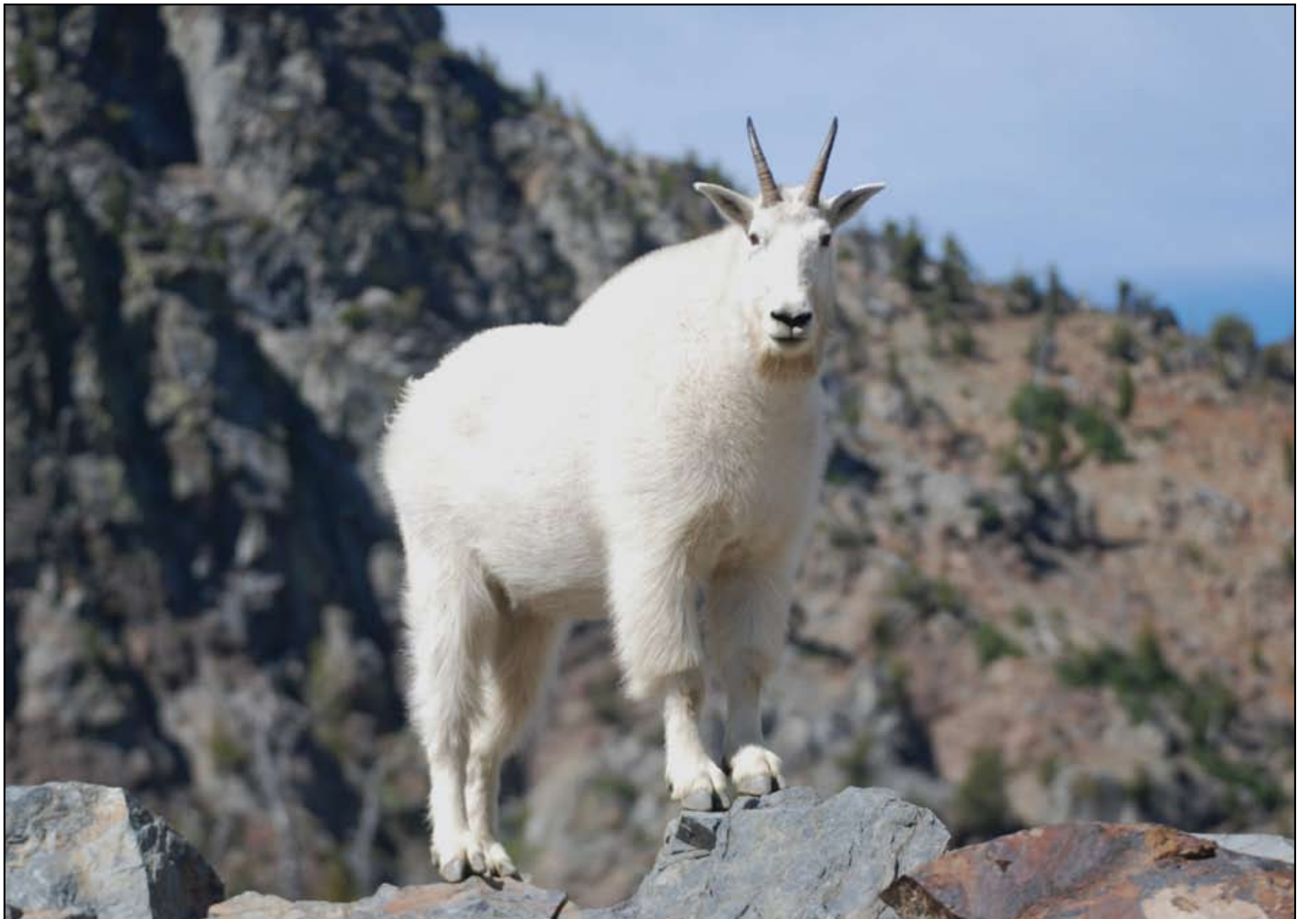
Baker County mountain goat